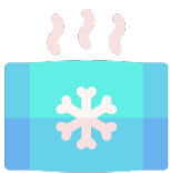
冰敷袋 cold pack