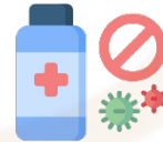
雙氧水(過氧化氫) hydrogen peroxide