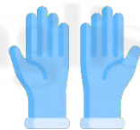
乳膠手套 latex gloves