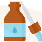
優碘 povidone-iodine solution